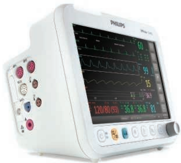
Philips Efficia CM10 patient monitor

Efficia patient monitors focus on core monitoring functionality with proven accurate and reliable Philips physiological measurements.