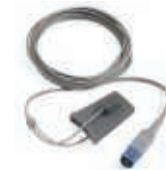
SpO 2 monitoring