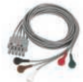
ECG / EtCO 2 monitoring